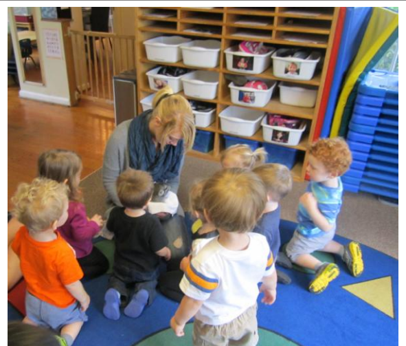
Toddler Time with Chi Chi the Chinchilla

Make a snowball, make a snowball. (pretend to make snowball) Throw it now, throw it now. (Use throwing motion) Make a snowball, make a snowball. (pretend to make a snowball) Throw it now, throw it now. (use throwing motion)