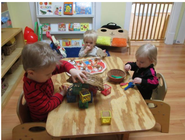
Montessori Work Time