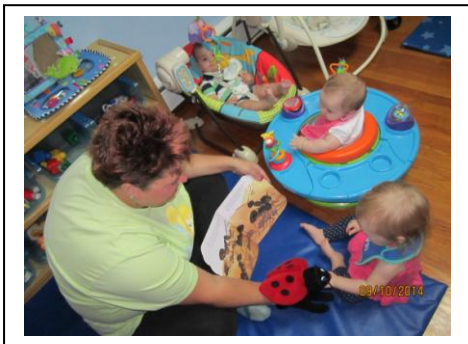
Story time with a ladybug puppet!