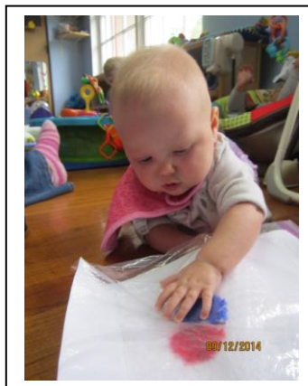
Painting through a Ziploc bag allows the child to be independently creative and not get messy!