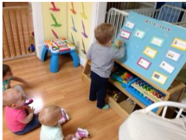
Music Time with our new Music Board

I'm A Little Teapot Row, Row, Row Your Boat If You're Happy and You Know It Itsy Bitsy Spider Jump Up And Down Old McDonald Open, Shut Them Five Little Ducks Twinkle, Twinkle Little Star The Wheels on the Bus Ten Little Monkeys Jumping on the Bed ABC's Head, Shoulders, Knees and Toes Five Little Monkeys Swinging in the Tree