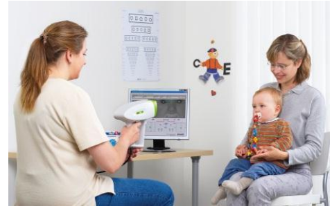
Screening Detects; nearsightedness, farsightedness, astigmatism, anisocoria, anisometropia, and allows the screener to observe for strabismus or a possible cataract.

This is to be considered a preliminary procedure, and does not constitute a diagnosis of vision problems. The costs of this program are being covered by the Missouri Lions Eye Research Foundation. More information about the Foundation can be obtained through our website at www.mlerf.org .