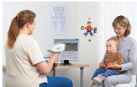
Screening Detects; nearsightedness, farsightedness, astigmatism, anisocoria, anisometropia, and allows the screener to observe for strabismus or a possible cataract.

This is to be considered a preliminary procedure, and does not constitute a diagnosis of vision problems. The costs of this program are being covered by the Missouri Lions Eye Research Foundation. More information about the Foundation can be obtained through our website at www.mlerf.org .