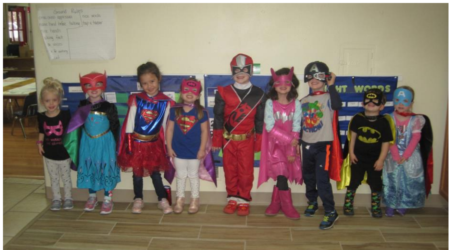
The extended day children enjoyed Super Hero Day they had during winter break.